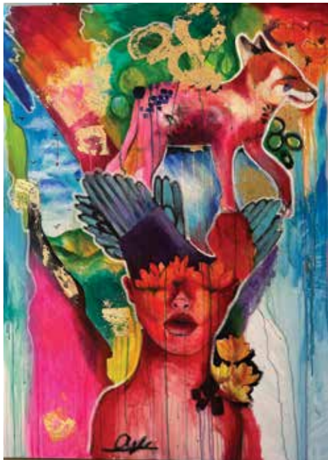
"Fox and Flora" by Anya Peri

Featured artwork was chosen from an open call to artists of all ages, and includes