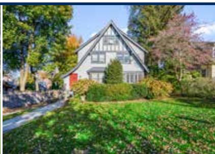
494 Wolfs Lane • Pelham Manor $1,150,000