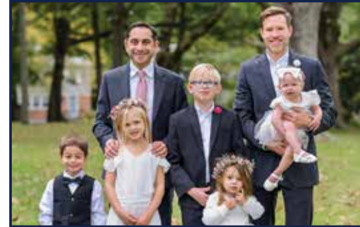
THE OWEN-MICHAANE FAMILY