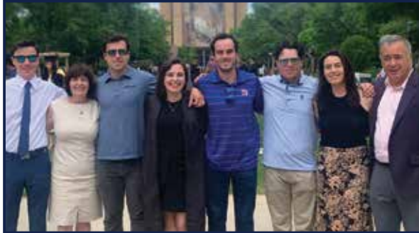
THE BENNETT FAMILY