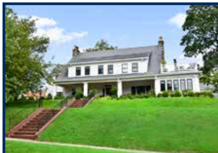
400 Pelham Manor Road • Pelham Manor $2,199,000